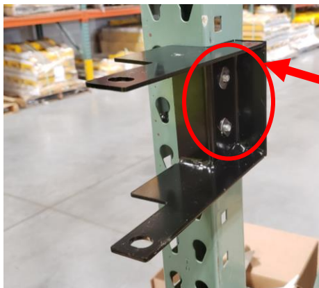
Mounting single bracket