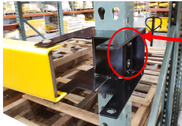
Mounting two brackets side-by-side