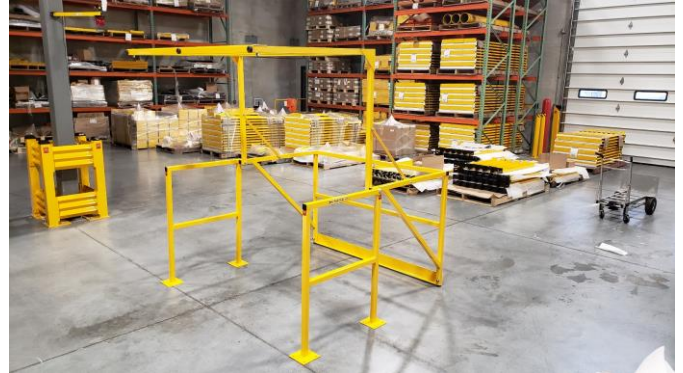
Figure 6 – Gate ready to receive pallet

6. Once the baseplates have been anchored and The crossbars have been secured, the gate is ready for use (Figures 6 – 8).